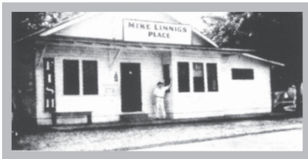
Original Building 1925

VOTED BEST SEAFOOD RESTAURANT, BEST FISH SANDWICH & BEST ONION RINGS! BY COURIER JOURNAL READERS POLL.